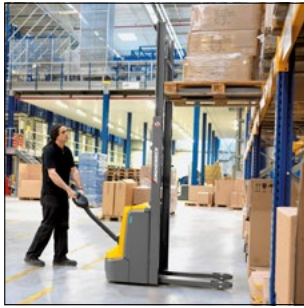
Excellent view of the load for precise positioning