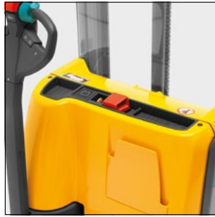
Good storage options for pens, tools and documents