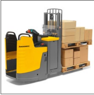
Fixed operator platform for maximum driver safety