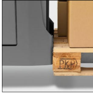
Precise operation with the pallet stop