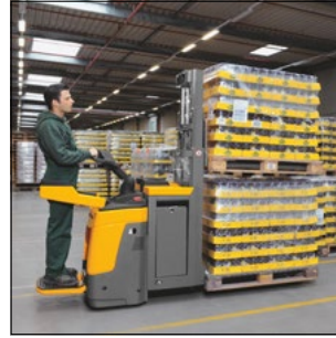
Flexible and safe operation